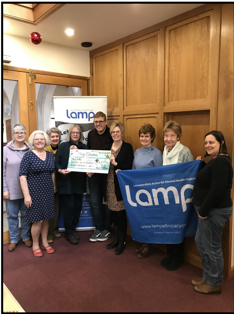
Some of the 2022 Christmas Tree Festival Team and volunteers presenting a cheque for £2,277.83 to the Vicar for St. Mary's Church Community Garden Project.