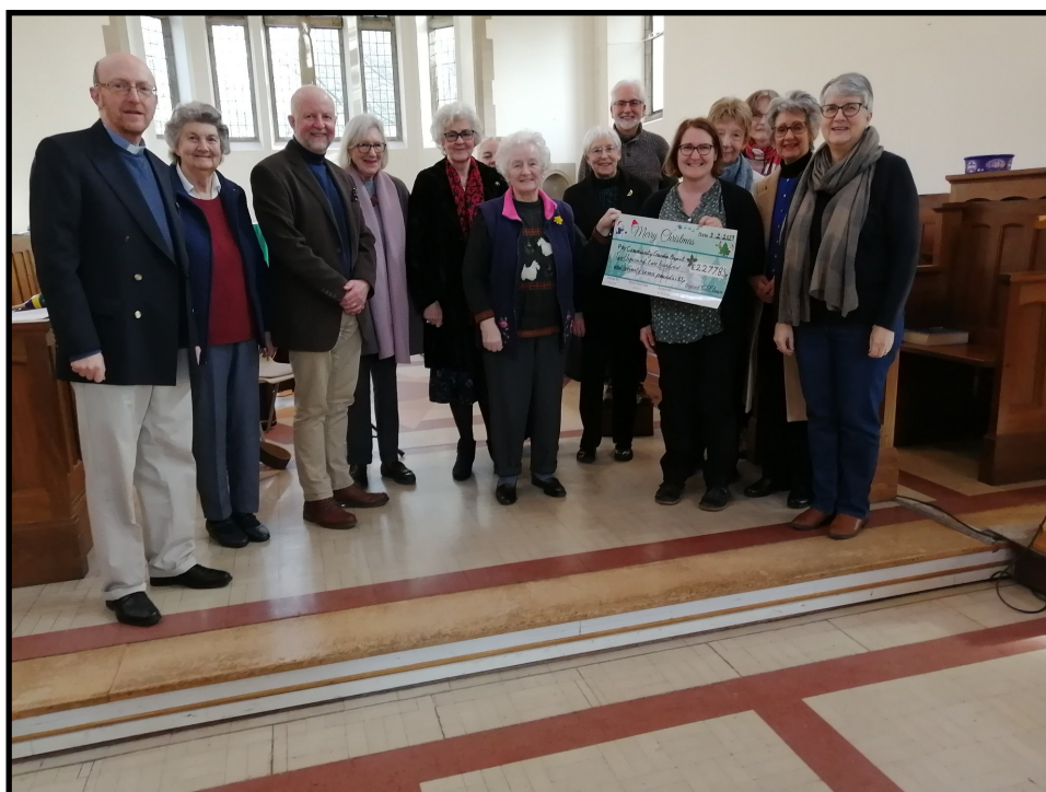
Half the profits from the 2022 Christmas Tree Festival, £2,277, were presented to members of LAMP, a local community mental health charity.