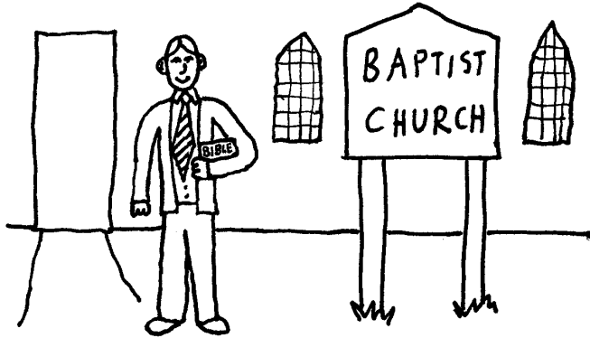
JOHN THE BAPTIST