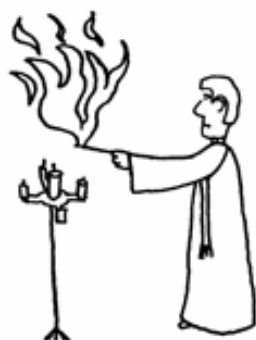
WHEN AN EASTER FIRE OR ADVENT CANDLE REFUSES TO LIGHT