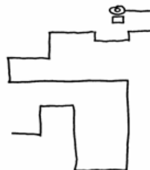
WHEN THE READER HAS A PARTICULARLY GRUELLING JOURNEY TO THE LECTERN