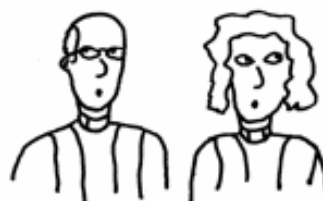
WHEN NOBODY HAS A CLUE WHAT IS SUPPOSED TO HAPPEN NEXT