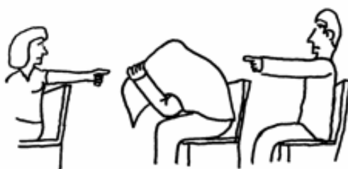
WHEN NO-ONE WILL ADMIT TO BEING THE PERSON DOWN TO LEAD THE INTERCESSIONS