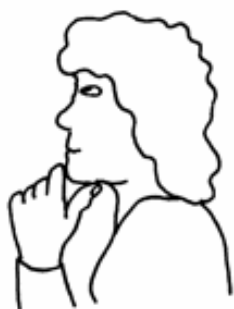
AT MOMENTS WHEN PONDERING IS EXPECTED

THIS IS ONE OF THE CENTRAL ELEMENTS OF A CHURCH SERVICE. WE OBSERVE A LITURGICAL PAUSE AT THE FOLLOWING POINTS: