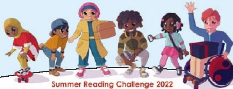
Summer Reading Challenge 2022