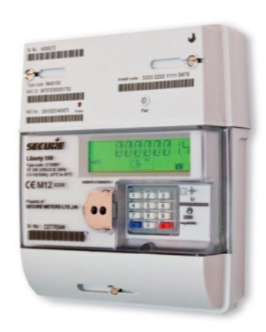
Electricity Smart meter